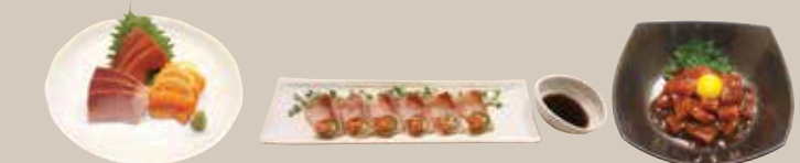
Assorted Sashimi お刺身盛り合わせ 15.95 Tuna, Salmon, Yellowtail Hamachi Carpaccio ハマチカルパッチョ 11.95 Chopped Tuna Tartar マグロのユッケ 9.95