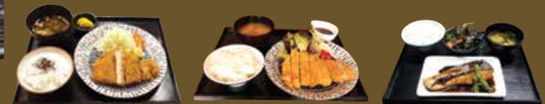
Pork Cutlet 11.95 とんかつ