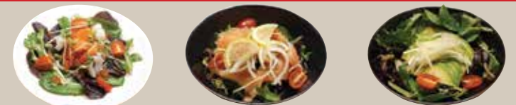
Hinoki ひのきサラダ 7.95 Seaweed and sashimi with wasabi soy sauce dressing Smoked Salmon スモークサーモン 6.95 Smoked salmon with soy sauce dressing Avocado アボカドサラダ 5.95 Avocado with wasabi soy sauce dressing