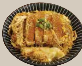
Katsu Don 11.95 かつ丼