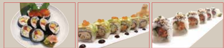
Hinoki ひのき 18.95 Yellowtail, tuna, avocado, egg custard, salmon roe, shrimp, shiso leaves Dragon ドラゴン 14.95 Shrimp tempura, avocado, salmon roe, crab stick, masago, mayo, eel sauce Spicy Tuna スパイシーツナ 9.95 Tuna, cucumber, spicy mayo, sesame seeds, grated shiso, tempura crunch, chives