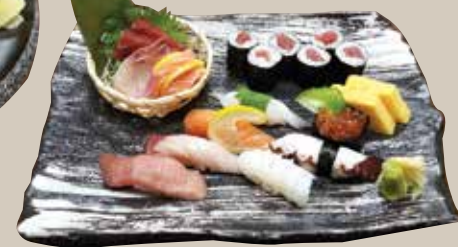
Sushi & Sashimi Combination 37.95 寿司&刺身コンビネーション