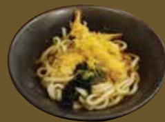
With Shrimp Tempura 9.95 えび天うどん