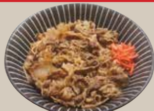
Beef Bowl 7.95 牛丼