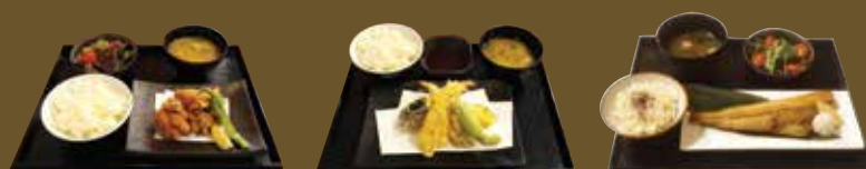
Fried Chicken 11.95 唐揚げ