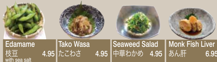
Edamame 枝豆 with sea salt 4.95 Tako Wasa たこわさ 4.95 Seaweed Salad 中華わかめ 4.95 Monk Fish Liver あん肝 6.95