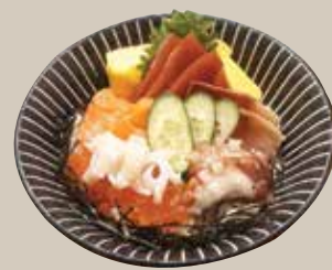
Kaisen Don 19.95 海鮮 Assorted sashimi over sushi rice