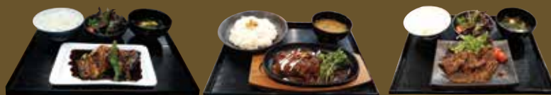
Chicken Teriyaki 11.95 チキン照り焼き