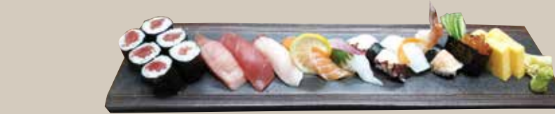
Sushi Deluxe 34.95 寿司デラックス