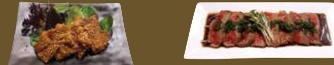
Yakiniku 焼肉 10.95 Japanese BBQ Beef Tataki 牛肉のたたき 12.95 Seared beef