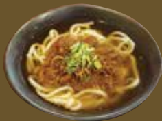
With Beef & Onion 9.95 肉うどん