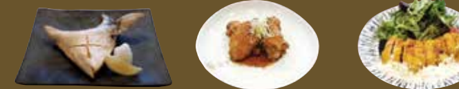
Yellowtail Collar ハマチかま 8.95 Chicken Wings チキンウイング 7.95 Chicken Nanban チキン南蛮 9.95