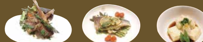
Lamb Chops 18.95 ラムチョップ Sauteed Branzino ブランジーニョ 18.95 Agedashi Tofu 7.95 餅入り揚げ出し豆腐 Fried tofu with rice cake