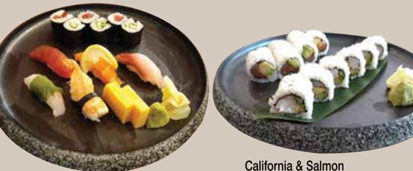
Sushi & Tuna, Cucumber Roll 14.95 寿司セット