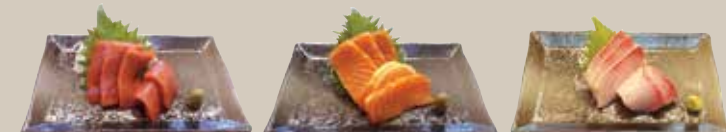
Tuna (Blue Fin) まぐろ(本まぐろ) 12.95 Salmon サーモン 10.95 Yellowtail ハマチ 11.95