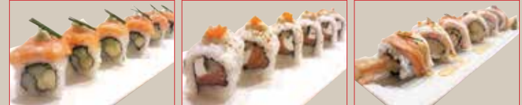
Alaska アラスカ 9.95 Salmon, avocado, cucumber, wasabi mayo, chives Philadelphia フィラデルフィア 9.95 Smoked salmon, cream cheese, cucumber, wasabi mayo, sesame seeds, masago Angel Hair エンジェルヘア 15.95 Shrimp tempura, crab stick, masago, chives, mango curry, mayo