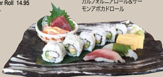
Sashimi & Sushi, California Roll 15.95 寿司、刺身セット