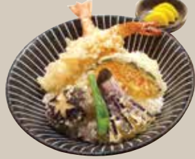
Ten Don 11.95 天丼 Assorted tempura