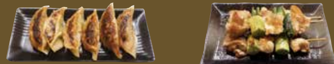
Pork & Chicken Dumplings 餃子 5.95 Yakitori 焼き鳥 6.95 Chicken & scallions on skewers