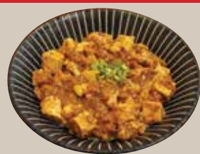
Mabo Tofu Bowl 7.95 マーボー丼