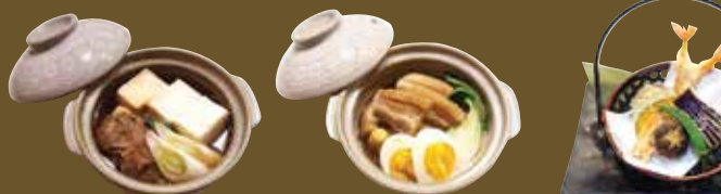
Sukiyaki Tofu 肉豆腐 12.95 Simmered tofu and beef Pork Kakuni 豚の角煮 13.95 Braised pork belly Assorted Tempura 天ぷら盛り合わせ 12.95 Shrimp and vegetable tempura *Vegetable tempura is available