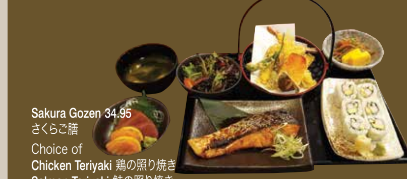
Sakura Gozen 34.95 さくらご膳 Choice of Chicken Teriyaki 鶏の照り焼き Salmon Teriyaki 鮭の照り焼き Black Cod Marinated in Saikyo Miso 銀鱈の西京焼き Japanese BBQ 焼肉 All served with assorted sashimi, assorted tempura, seasonal side dish, salad, California roll and miso soup メインディッシュにお刺身、天ぷら盛り合わせ、カルフォルニアロール、小鉢、サラダ、味噌汁が付きます。