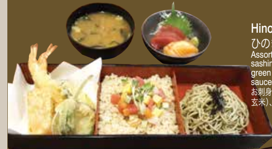
Hinoki Gozen 34.95 ひのきご膳 Assorted sashimi, assorted tempura, sashimi. Served over brown sushi rice, green tea noodles with cold dipping sauce and miso soup. お刺身、天ぷら盛り合わせ、ミニ海鮮ちらし(玄米)、茶そば、味噌汁が付きます。