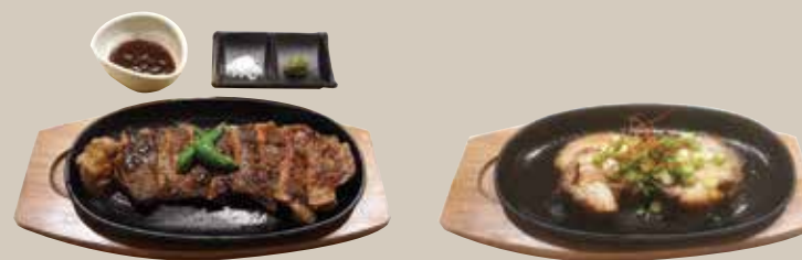
Beef Steak 24.95 ビーフステーキ Roasted Pork 10.95 厚切りチャーシュー