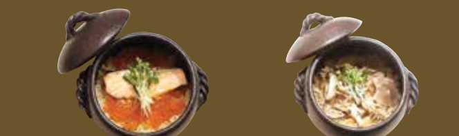
Salmon & Ikura 18.95 サーモンといくらの鍋ご飯 Salmon & salmon roe over rice in clay pot Chicken & Mushroom 13.95 鶏肉ときのこの鍋ご飯 Chicken and mushroom over rice in a clay pot